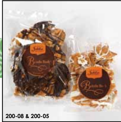
200-08 & 200-05