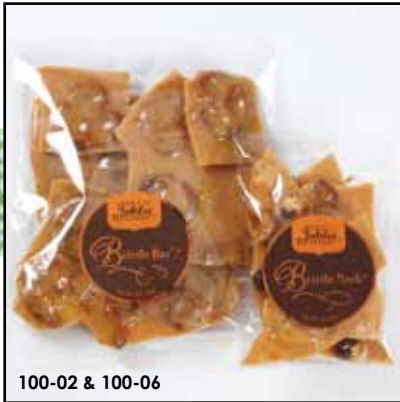
100-02 & 100-06