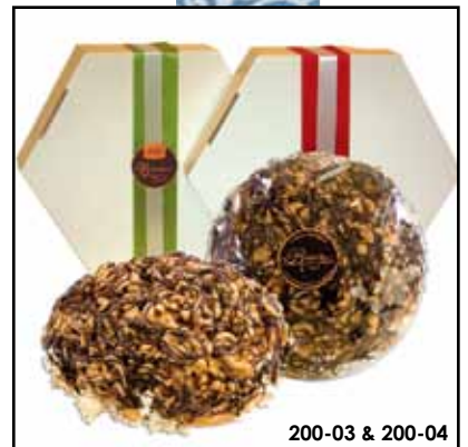
200-03 & 200-04