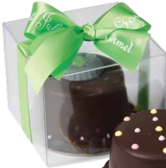
Cakes can be sliced to serve 6-8

All our fudge is enrobed in premium milk or dark chocolate, keeping the luscious centers soft and delicious.